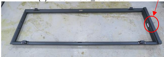
(6): Black metal_ frame of cabinet