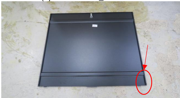
(4): Black metal_ side door