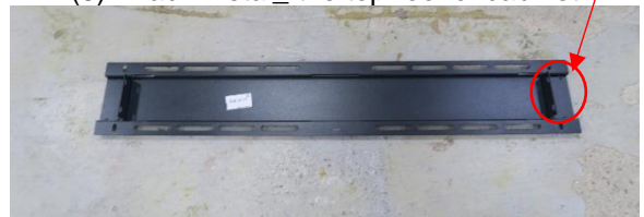
(7): Black metal_ support bar