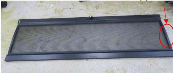
(2): Black metal_ front door