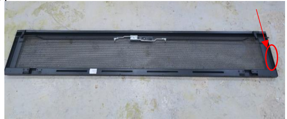
(3): Black metal_ rear door