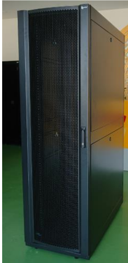
Amtec RoYal-DC Datacenter Cabinet 42U 600x1200