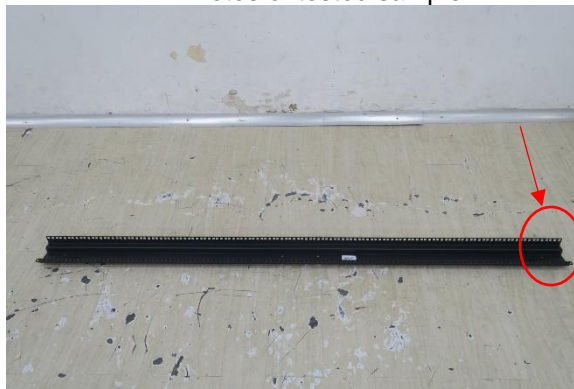
(1): Black metal_ profile bar